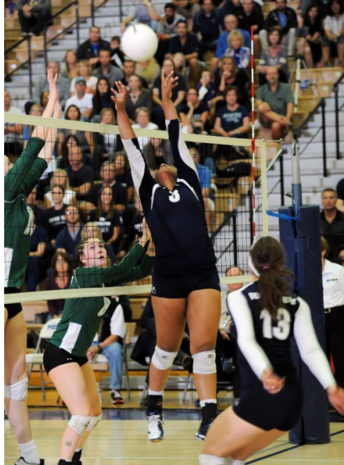
Division I - Volleyball State Championship (Desert Vista High School vs. Hamilton High School)