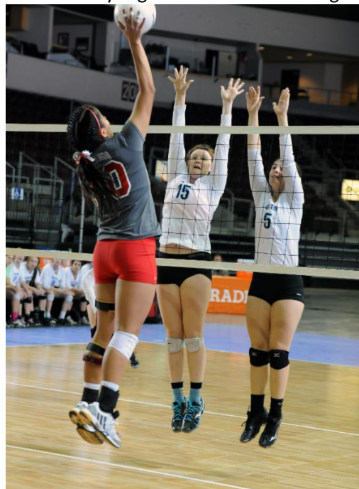
Division II - Volleyball State Championship (Sunnyslope High School vs. Ironwood Ridge High School)