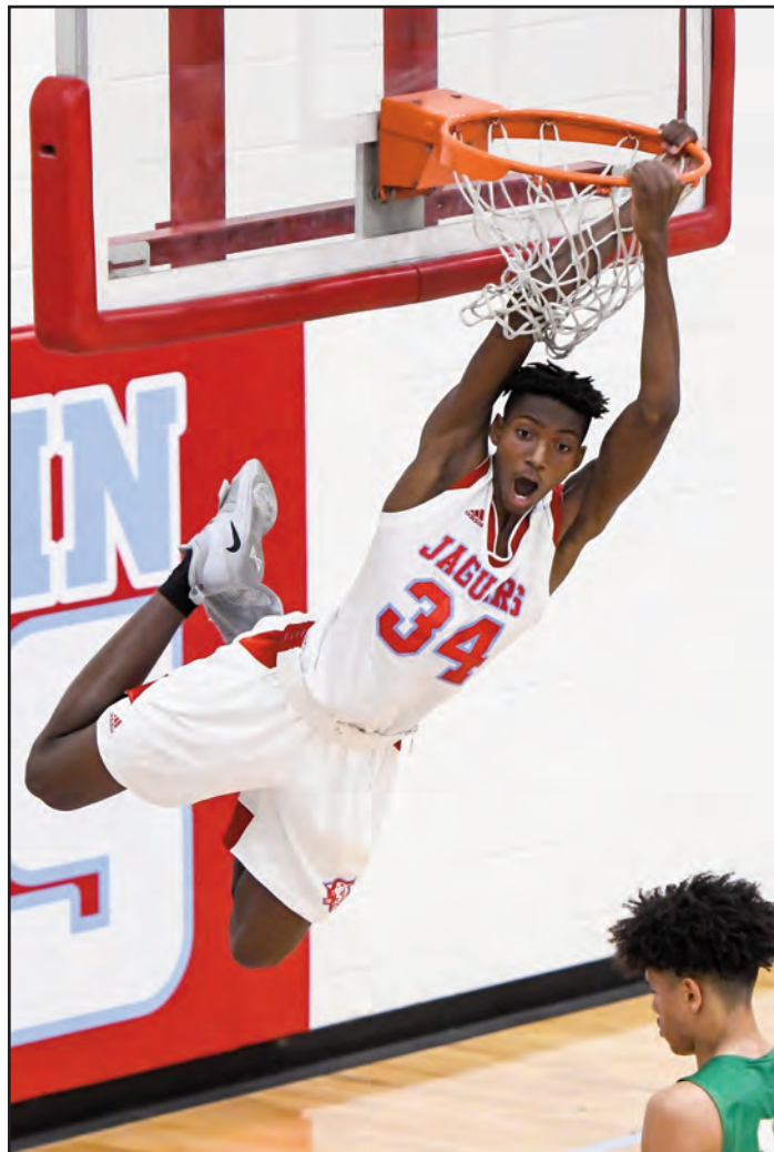
South Mountain is in the state semifinals for the first time since 2008.