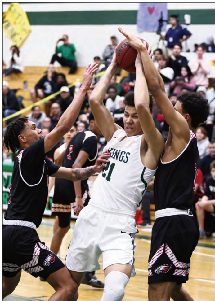
Sunnyslope and Ironwood will be playng for the fourth time this season when they meet in the state semifinals.