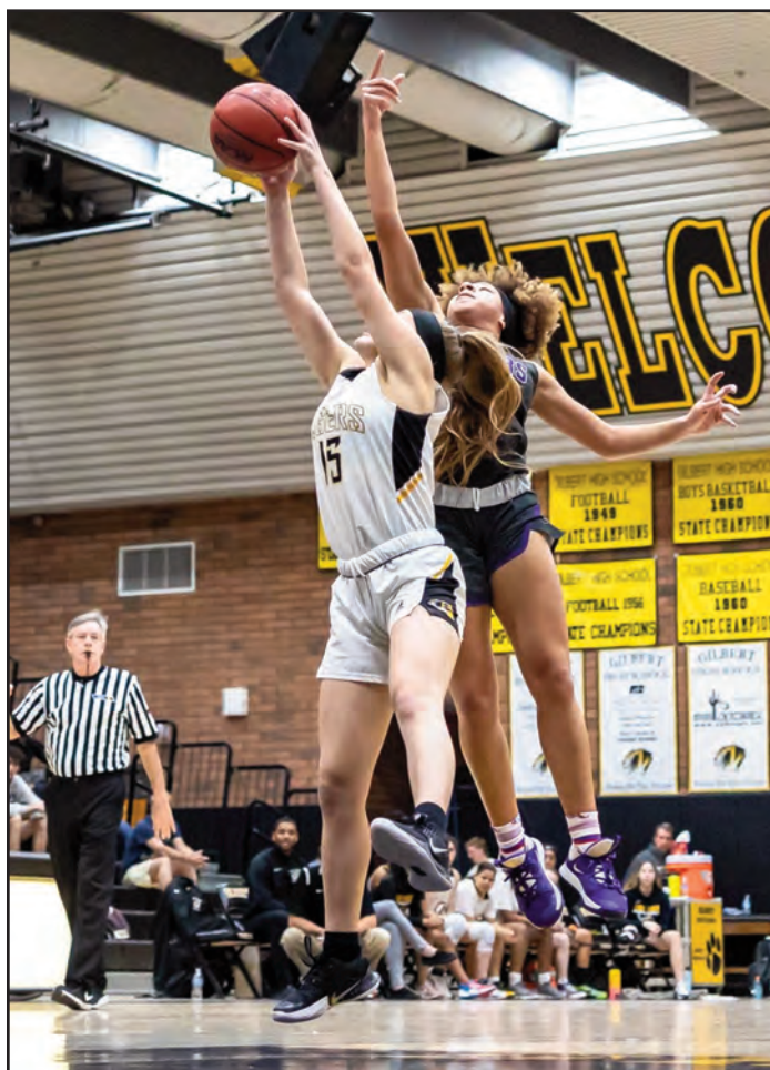
Gilbert and Millennium, which played for the 5A title last year, will see each other in the semis this week.

“After losing a great group of seniors, and coming off a state title, many teams may have become complacent, but not this group. They have embraced the message that everything must be earned, and what we did last year doesn’t guarantee us anything this year.”