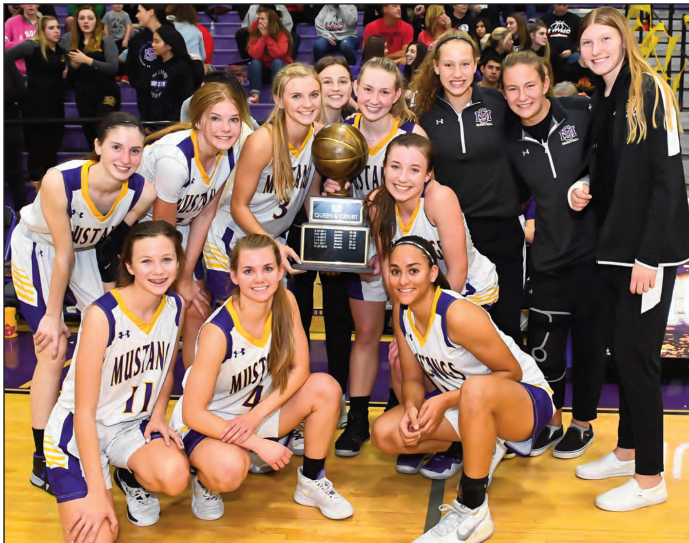
Sunrise Mountain is in the state semifinals for the first time since 2001.