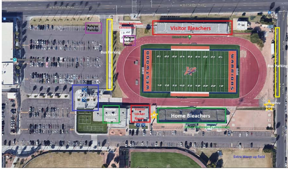
Blue - Main Entrance for fans and teams

Yellow - Bus Parking Bathrooms, Concession Stand on both sides Star - Emergency Personnel Access Point/AT